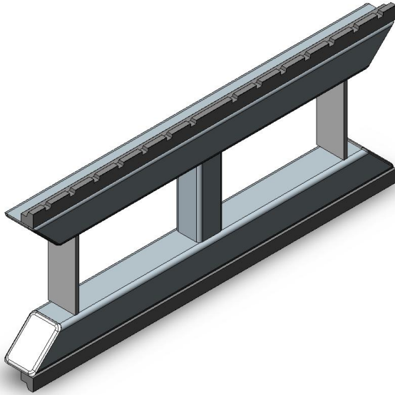
(Type CB3-5000 shown above)

The type CB Universal Carriage is a weld on unit suitable for all machinery and agricultural applications where Fork Tines are to be fitted. Manufactured from high grade steel in accordance with AS2359.11, this Carriage is precision machined to suit either Class 2 or Class 3 Fork Tines. The Safe Working Load (SWL) of this unit varies between 1.5 & 5 Tonne at a Load Centre of 500mm depending on type chosen – refer chart below. These units are supplied unpainted.